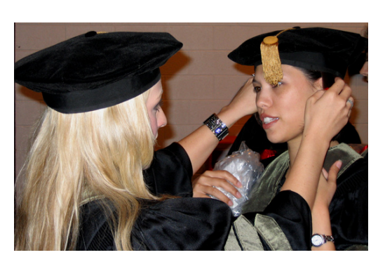
Graduation Weekend May 18-19, 2007