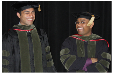
TTUHSC School of Pharmacy

Good Luck to each member of the Class of 2007. We celebrate the many things you accomplished during the last four years and we can't wait to see what you achieve during your careers!